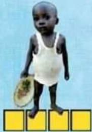
Amount of grain needed to eliminate world hunger

There is plenty of food for all of us if we just eat plants directly.